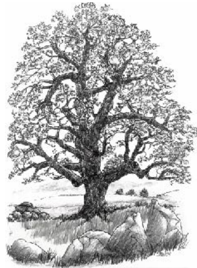
Art courtesy of Margie Wall

To grant those who mourn in Zion, Giving them a garland instead of ashes, The oil of gladness instead of mourning, The mantle of praise instead of a spirit of fainting