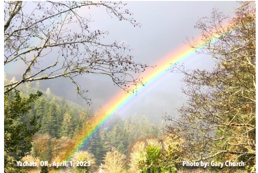
Yachats, OR, April, 1, 2023